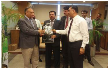
Banca Performance Review – Central South Cluster