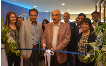
UBL inaugurates state-of-the-art Contact Center in Islamabad