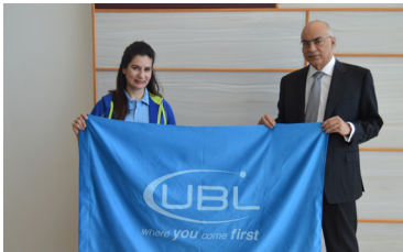
UBL team member summits Africa's tallest peak