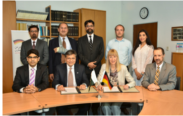
UBL facilitates Pakistani Students aspiring to study in Germany