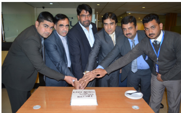
UBL Ghelay Branch, Mirpur District, Azad Kashmir reaches deposit milestone of PKR 1 Billion