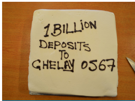
Cake prepared especially for the occasion

“ UBL Ghelay Branch, Mirpur District, Azad Kashmir Region recently achieved a milestone of PKR 1 Billion Deposits. ”