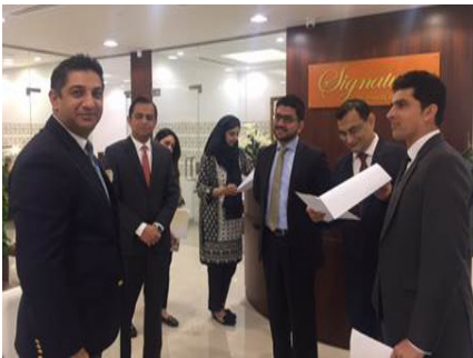
Participants at Barsha Branch