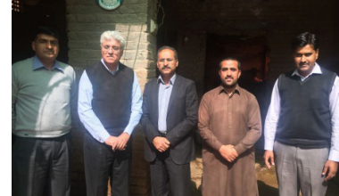
DH Agribusiness visits for Sukkur Region for Business Review Meeting