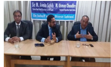
Retail Operations Review Meeting - City District Sahiwal