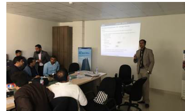
Service Quality Team Conducts Service Clinics