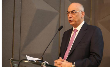
Rural Bank Annual Conference 2017