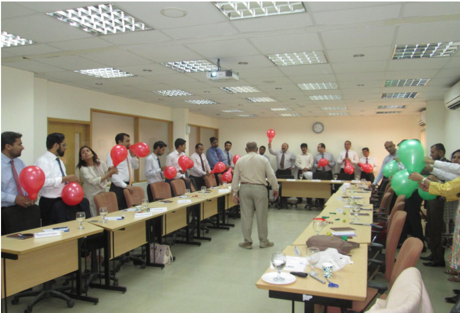
Participants during the training session on Stress Management at the UBL Learning & Development Centre, Karachi

UBL Learning & Development Centre South recently organized a full day soft skills training session on stress management for select staff members. The interactive session included different exercises and group activities. The objective of the training was to educate employees on the modern scientific techniques to overcome stress effectively.