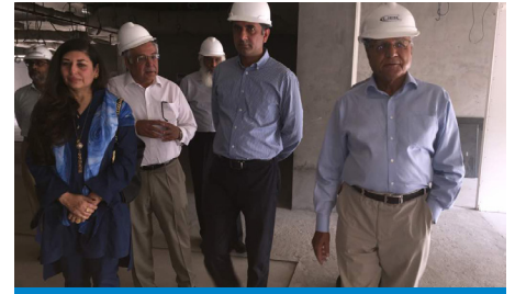
Sir Mohammed Anwar Pervez, OBE HPk reviewing the progress being made in the construction of the building