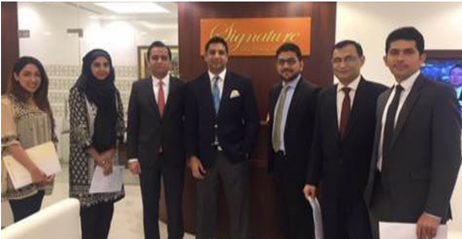
Participants at Barsha Branch