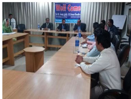
CSOMs of City District Sahiwal during the session