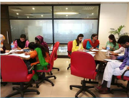
Participants during course work activities

“The trainer briefed the audience about new features of the product which included the loading/reloading of Wiz Cards through UBL Contact Centre and Omni Dukaans”