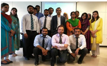
UBL Wiz Prepaid Card Training conducted for branches –North Cluster