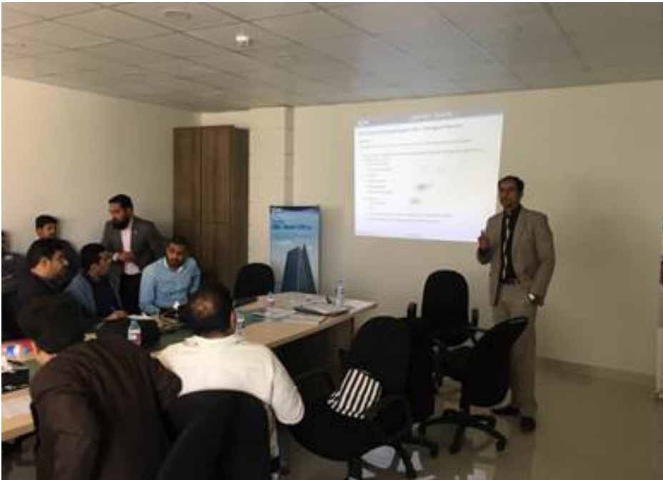
Participants of City District Multan