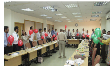
Training session on Stress Management arranged by UBL Learning & Development Centre South