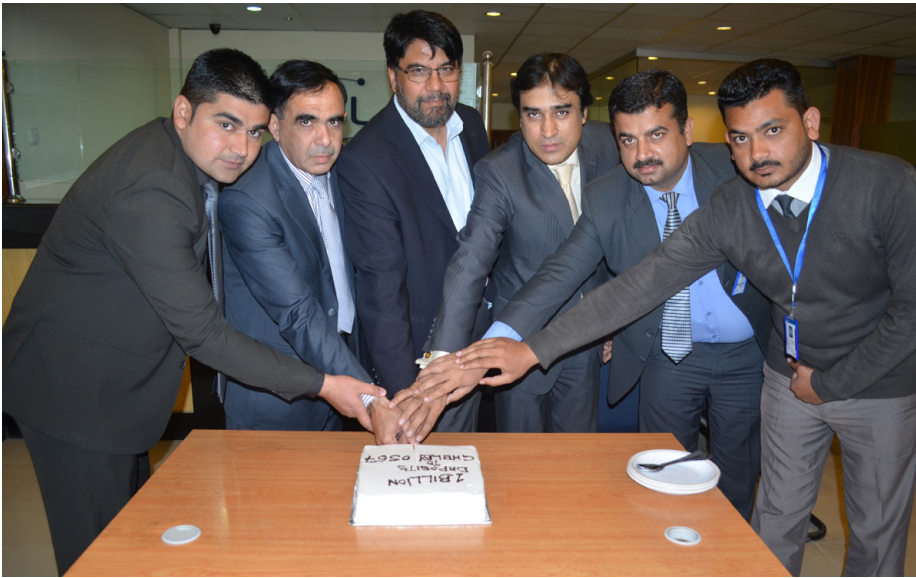
Cake Cutting Ceremony