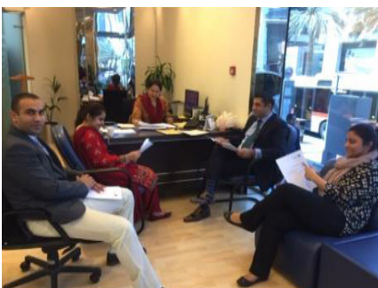
Participants at Bur Dubai Branch

The UBL UAE Signature Priority Banking team, in collaboration with Human Resources, recently conducted multiple training sessions in Dubai. The aim of these sessions was to introduce the salient features of the Signature Priority Banking offering and develop a comprehensive understanding of Signature Priority Banking amongst staff members. The initiative was taken in line with the strategy to expand Retail Banking in UAE