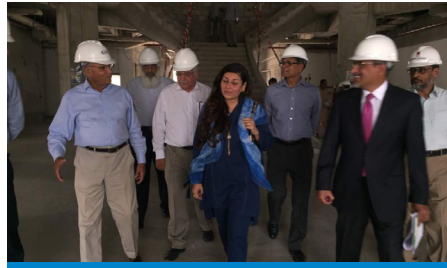
Sir Mohammed Anwar Pervez, OBE HPk reviewing the progress being made in the construction of the building