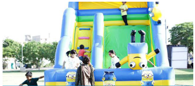
Fun activities at the event