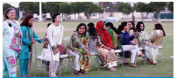
Fun activities at the event