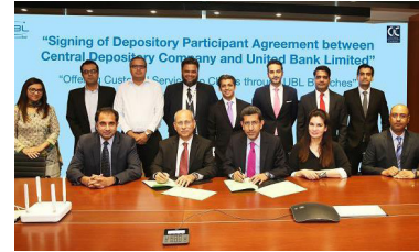
UBL and Central Depository Company sign a participant agreement