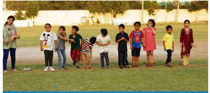
Fun activities at the event