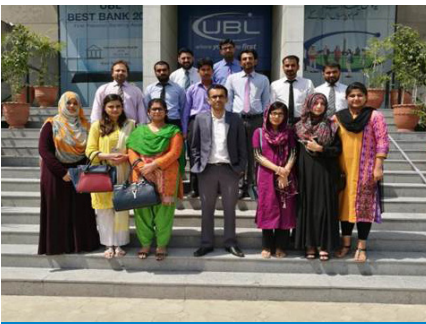
Participants with the trainer after the session

The trainer briefed the audience about new features of the product which included the loading/reloading of Wiz Cards through UBL Contact Centre and Omni Dukaans. He also explained the Biometric issuance process of Wiz Cards through the E-form.