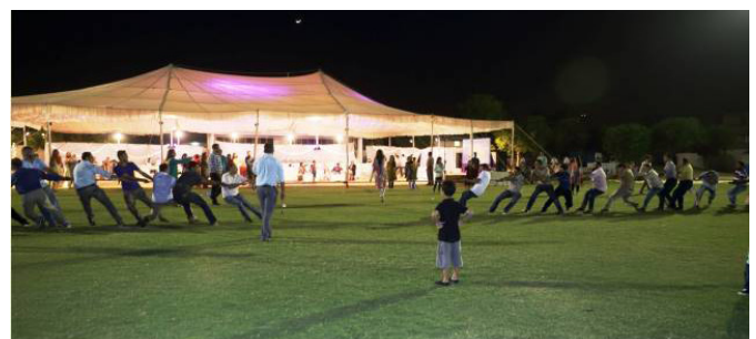
Fun activities at the event

“The event served to reinforce the importance of recreation and team-building efforts for the enhanced performance and motivation of employees.”