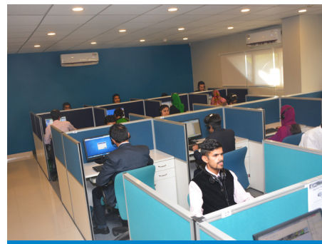
A view of the UBL Contact Center in Islamabad

“ The visiting group was given a detailed overview on the Contact Center’s services and how it has now emerged as one of the leading Banking contact centers in Pakistan ”