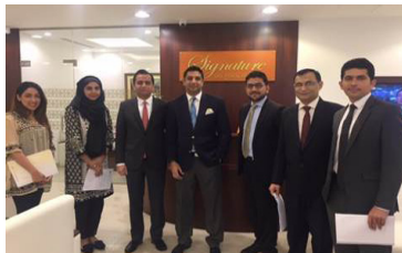
Training Sessions on Signature Priority Banking - UBL UAE