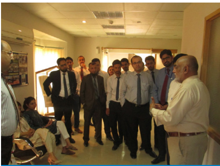
Participants during the training session on Stress Management at the UBL Learning & Development Centre, Karachi

UBL Learning & Development Centre South recently organized a full day soft skills training session on stress management for select staff members. The interactive session included different exercises and group activities. The objective of the training was to educate employees on the modern scientific techniques to overcome stress effectively.