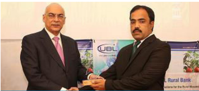
Top Performers receiving the Awards from the President & CEO