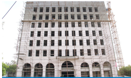
Outer design of the building follows the Edwardian architecture theme which boasts the first-of-its-kind façade stone structure in Pakistan

“The Chairman also shared with the team his vision of turning this work-in-progress into a major iconic landmark in Lahore”