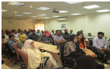
UBL Wiz Prepaid Card Training conducted for branches –South Cluster