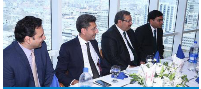
Lunch at the Rural Bank Annual Conference