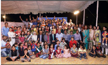
Compliance Group holds Family Gala 2017