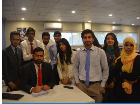
Group Photo of representatives of the UBL Contact Center in Islamabad