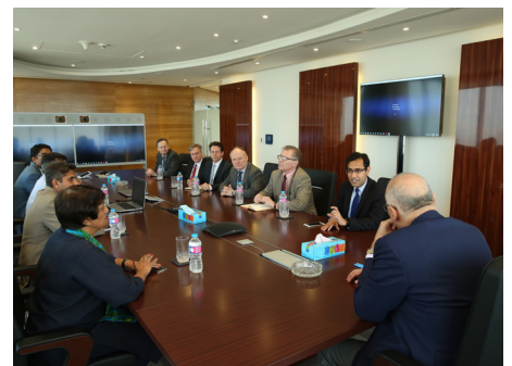
UBL team in discussion with the visiting parliamentarians