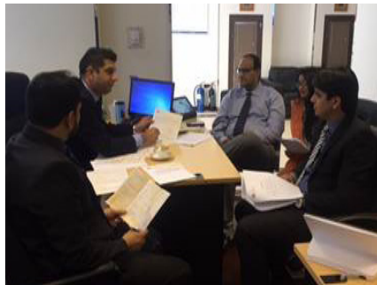
Participants at Deira Branch