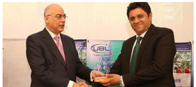
Top Performers receiving the Awards from the President & CEO