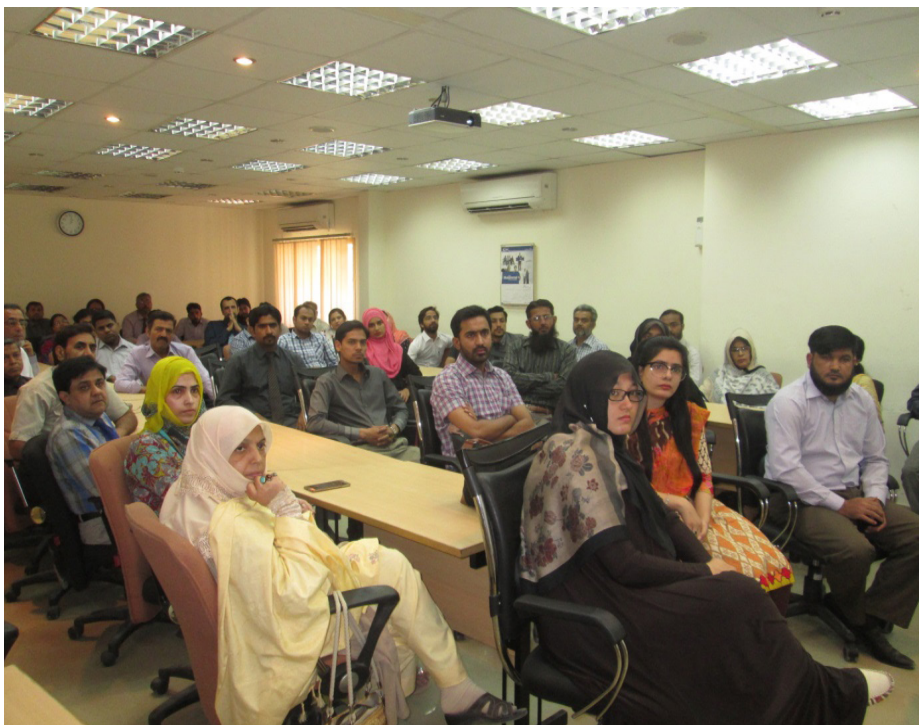
Participants at the session